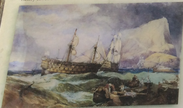
Victory Towed back to Gibraltar in 1805, Clarkson Stanfield, 1852