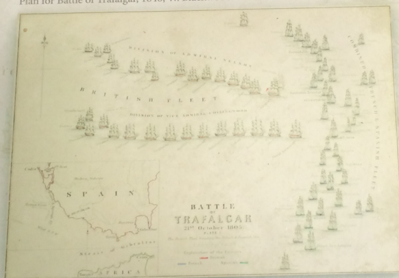
Plan for Battle of Trafalgar, 1848, W. Blackwood & Sons

Other seamen from the battle of Trafalgar who died of their wounds at the old Naval Hospital were buried in the St Jago's Cemetery on the northern side of this defensive wall, however these tombstones were moved here in 1932 and set into the eastern wall. There are also a few freestanding stones, some of which date back to the 1780s, which have been transferred over the years from the Alameda Gardens. Many of the rest of the tombs here are of the victims of the three terrible yellow fever epidemics that ravaged Gibraltar in 1804, 1813 and 1814. There are also tombs from service casualties from the sea battles- the Battle of Algeiras (1801), and other actions off Cadiz (1810) and Malaga (1812), during the Napoleonic Wars.