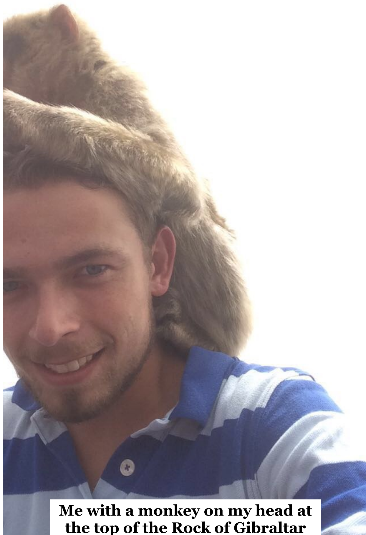
Me with a monkey on my head at the top of the Rock of Gibraltar