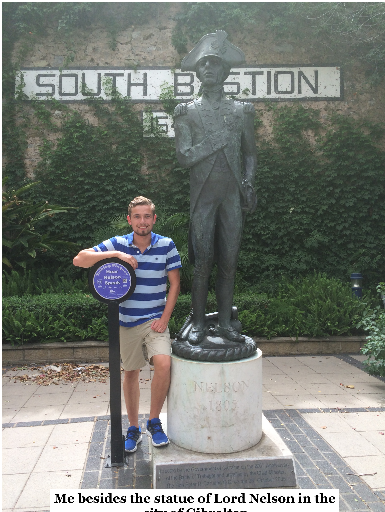
Me besides the statue of Lord Nelson in the city of Gibraltar