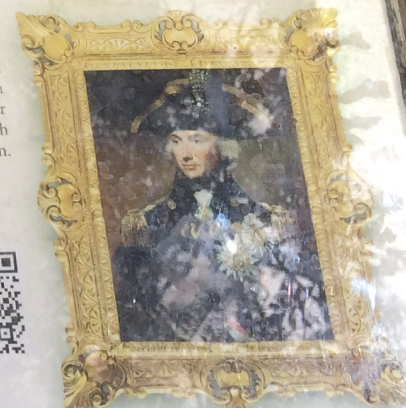
Vice Admiral Horatio Lord Nelson, Abbott, 1898