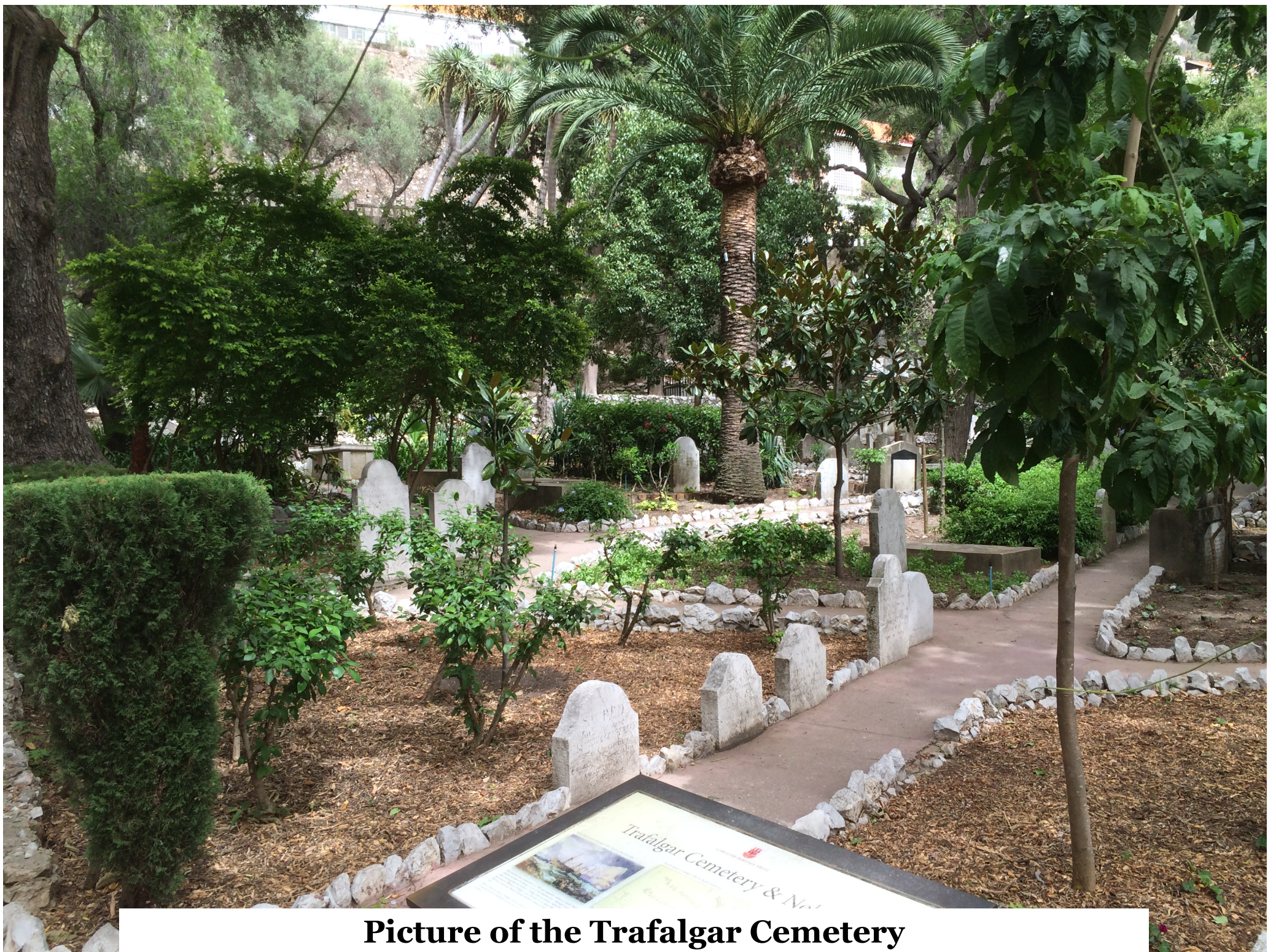
Picture of the Trafalgar Cemetery